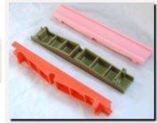
10ACA275348 (Standard Weight)