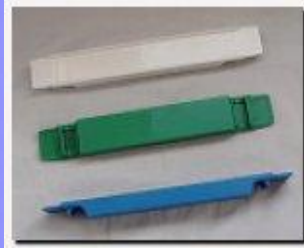
SP1/SWE (Spring Loaded)

These FLIGHT PROGRESS STRIP HOLDERS / FLIGHTSTRIP HOLDERS are quality plastic injection mouldings compliant with the relevant specifications, designed to give long life and ease of use. There are several versions but the most common are listed below. If you require a special type please contact us. We will be pleased to quote you.